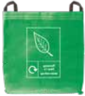
Green dumpy sack

Contact us to register for this chargeable collections service