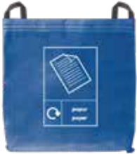
Dark blue bag