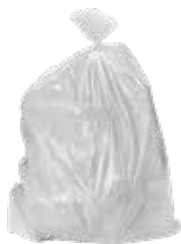
Single-use white sack