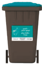
Black bin with turquoise sticker