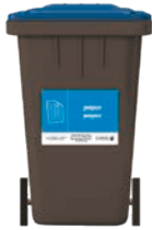
Black bin with dark blue sticker