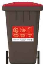
Black bin with red sticker