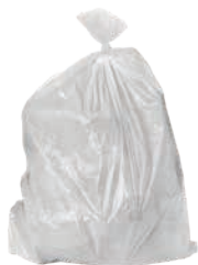
Single-use white sack