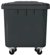
Black bin with black lid