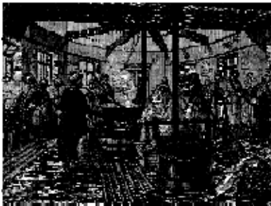
"Prisoners working at the Tread-wheel, and others exercising... in the Vagrants' Prison, Coldbath Fields."

"The men were allowed to keep their earnings. The women received one shilling per week for washing, and four pence in every shilling which they earn by sewing... standing on wooden gratings, washing away at the wooden troughs ranged around the spacious wash-house... with their bare red arms, working the sodden flannels against a wooden grooved board that is used to save the rubbing of clothes... Two women in the centre are turning the handles of the wringing machine... scattered about the place are tubs full of brown wet sheets, large baskets of blankets, and piles of tripey-looking flannels; whilst a dense white mist of steam pervades the entire atmosphere."