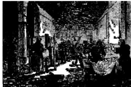
"The wash-house and ironing room at Brixton Prison."

(Criminal Prisons in London and Scenes of Prison Life by H. Mayhew and J. Binny, first published in 1862.)