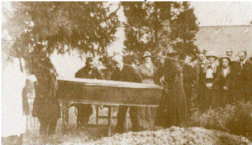
Cerdyn post o angladd Coch Bach y Bala.

Roedd cymaint o ddiddordeb yng Nghoch Bach y Bala fel bod cardiau post yn dangos ei angladd a'r fan lle cafodd ei saethu ar werth i'r cyhoedd.