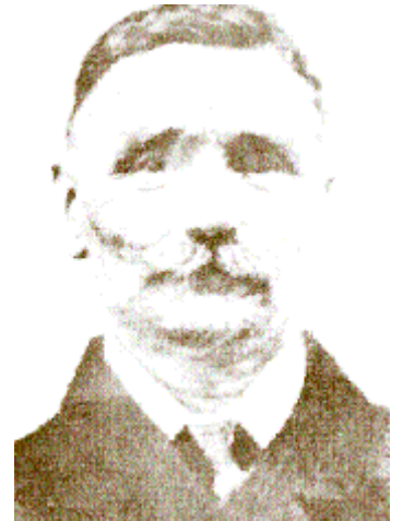
Coch Bach y Bala