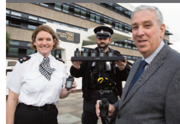
Body worn video investment

This leaflet gives a breakdown of how much of your council tax is spent on policing and an indication of where your money goes. For more information about the police budget, please visit my website: www.northwales-pcc.gov.uk