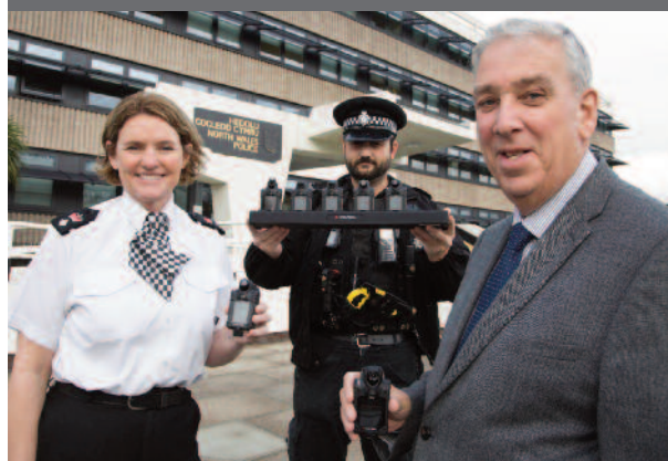
Buddsoddiad mewn offer fideo a wisgir ar y corff

Mae'r daflen hon yn dangos i chi faint o'ch treth cyngor sy'n cael ei wario ar blismona ac yn rhoi syniad i chi lle mae'r arian yn mynd. Am fwy o wybodaeth am gyllideb yr heddlu, ymwelwch â fy ngwefan: www.northwales-pcc.gov.uk