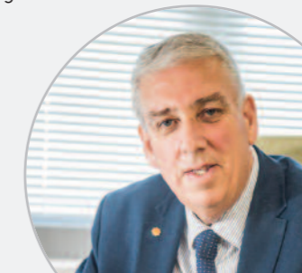
Arfon Jones North Wales Police and Crime Commissioner

The Chief Constable assures me that an increase of 3.58% enables him to effectively deliver against my Police and Crime Plan, which was published in 2017.