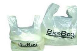
Supermarket bought biobags

IMPORTANT: If your caddy contains bags other than those supplied by Denbighshire County Council, then your caddy will NOT be emptied.