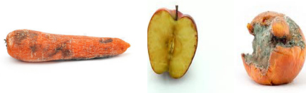
Peelings and rotten vegetables