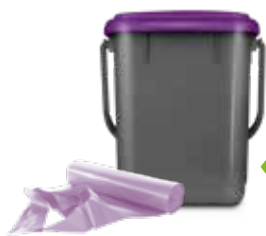
Black caddy with purple lid and single-use purple sacks