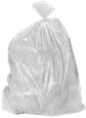
Single-use white sack