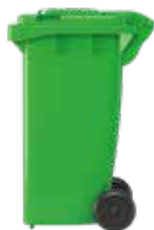
Green wheelie bin