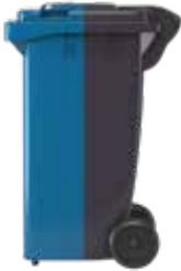
Black wheelie bin OR Blue wheelie bin