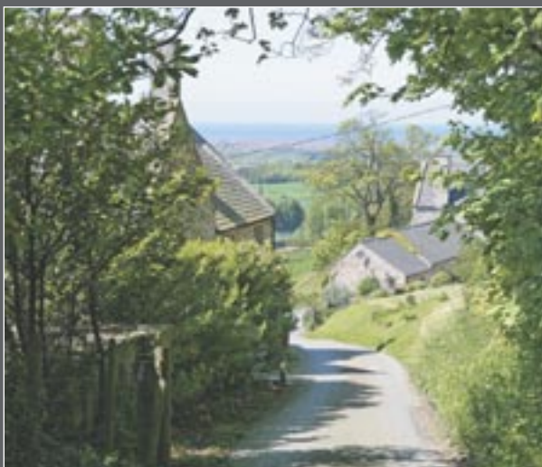
View from above Pentre Cwm.

Passing the farm of Hottia on your left you will swing round to the right towards the start of the houses. Keep on St. Asaph Road as it bends with the fields on your left and walk along until another road joins it from the right at an angle. Turn right up this road (Cwm Road) for about 30 yards. Then on your left between the side of the last bungalow and the grassy bank of the school playing fields there is a footpath which takes you up onto the Coronation football field. Cross this field and you will find yourself back in the Thomas Avenue car-park.