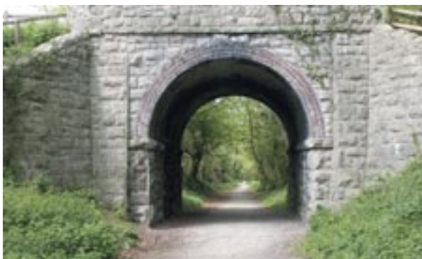
Stone bridge over Dyserth-Prestatyn Walkway.

gate and take steps down to join the Dyserth to Prestatyn Walkway turning right towards Prestatyn. Look out for the low level caves in the limestone rock on the right (grilles fitted to prevent unauthorised entry). Follow walkway until reaching wooden gate and the old railway goods shed (stone building) on the left.